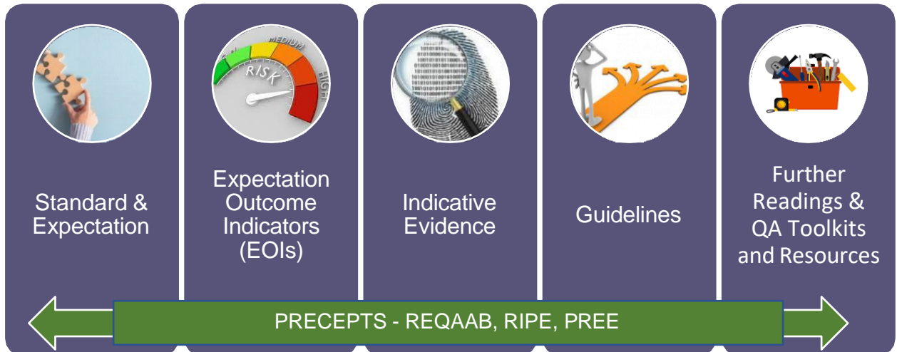
Figure 3: The key elements of the precepts

These key elements of the Precepts are carefully designed and developed in order to make it easy for all the stakeholders to understand and implement Precepts and their execution for review, ensuring the effectiveness of implementing standards and monitoring practices.